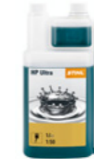
HP Ultra Fully synthetic two-stroke engine oil