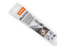
Multilub Multipurpose grease for all STIHL hedge trimmers and electric saw gears