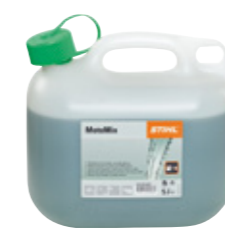
MotoMix Premixed fuel (1:50) for all STIHL engines